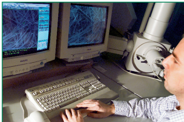
All Camfil 5-Star products incorporate fine fiber technology to ensure that those products maintain their published efficiency throughout the life of the filter. Our R&D department reviews fiber size and evaluates media alternatives on a continuous performance assurance program.

Independent research by cognizant authorities and doctoral programs have looked at the performance of coarse fiber filter products (electrostatic) over time and have concluded that these products experience a drop in efficiency as the filters load with particulate, or as the charge naturally dissipates. A coarse fiber filter may operate at a MERV 13 at installation and may decrease in efficiency to a MERV 9 over a relatively short period of time.