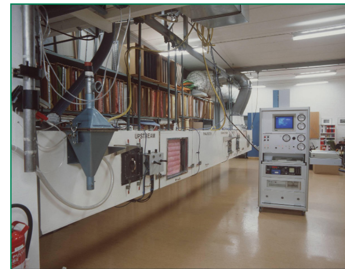
With multiple air filter testing laboratories around the world, Camfil evaluates our products and competitive products on a daily basis. Tests are performed on virtually every type of air filter, from low-level arrestance type HVAC grade filters to the ULPA filters used in the highest level of cleanrooms. Flat sheet testing and discharge, dust collection cartridges and media, and carbon products may be evaluated in other Camfil testing rigs.

There are studies that show that a coarse fiber filter increases in resistance to airflow faster than a fine fiber product, but that is only true of some products, not all.